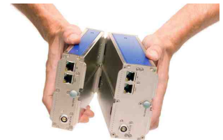
imc Click Mechanism

Alternatively, connection can be made by means of standard Ethernet cables (RJ45, CAT5), thus creating a spatially distributed system.