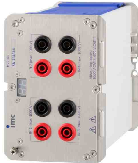
imc CRONOSflex High Voltage input module (CRFX/HV2-4U)