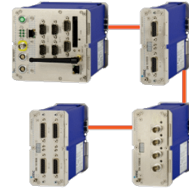
imc CRONOSflex distributed system