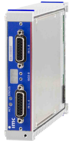
CRXT/UNI-4 (Fig. similar)

The channels are individually, galvanically isolated for voltage, current and thermocouple measurements. Each channel is equipped with its own simultaneous A/D converter and adjustable filter (e.g., anti-aliasing filter).