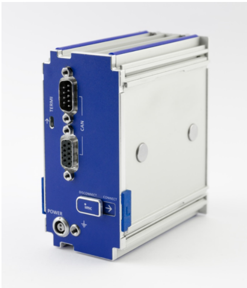
protective cover left (labeled with "L")

Device certificates and calibration protocols: Detailed information on certificates supplied, the specific contents, underlying standards (e.g. ISO 9001 / ISO 17025) and available media (pdf etc.) can be found on our website, or you can contact us directly.