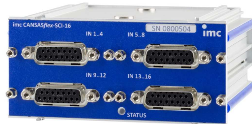
imc CANSASflex-SC16 (Fig. similar)

Module versions with DSUB-15 connectors support all measurement modes. Versions with alternative connectors, such as thermocouple inputs, support only these selected modes.