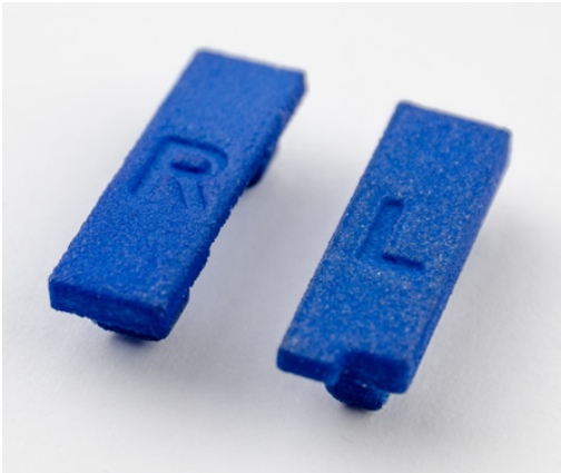
Set consisting of left and right protective cover