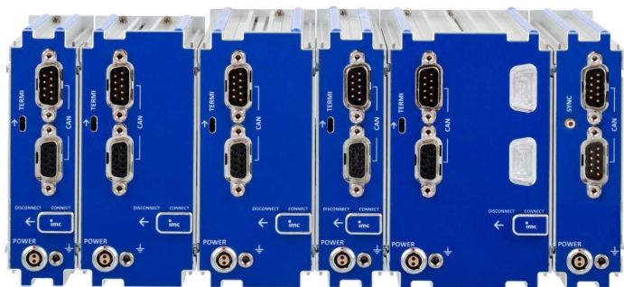
rear view of this block: CAN, Power supply, Terminator, Locking slider