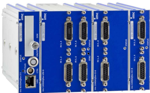
imc CANSASflex modules connected (Click-mechanism) in a block with imc BUSDAQflex Logger (left)