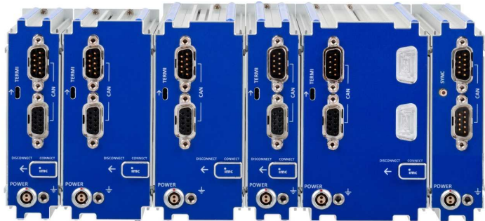
rear view of this block: CAN, Power supply, Terminator, Locking slider