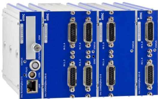
imc CANSASflex modules connected (Click-mechanism) in a block with imc BUSDAQflex Logger (left)