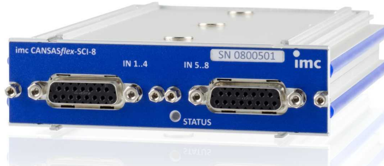
imc CANSASflex-DO8R (Fig. similar)

CAN module for 8 or 16-bit digital outputs as relay