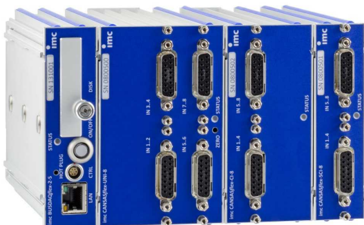
imc CANSASflex modules connected (Click-mechanism) in a block with imc BUSDAQflex Logger (left)