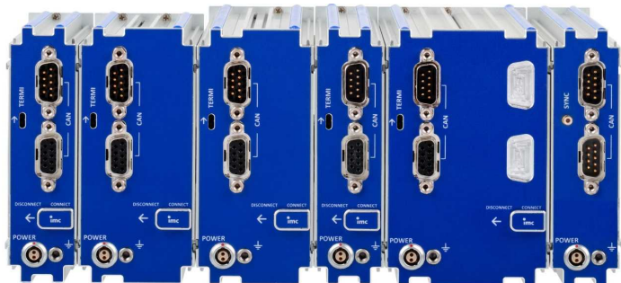
rear view of this block: CAN, Power supply, Terminator, Locking slider