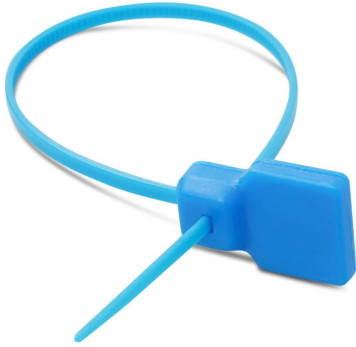
Tags as cable tie (140mm)