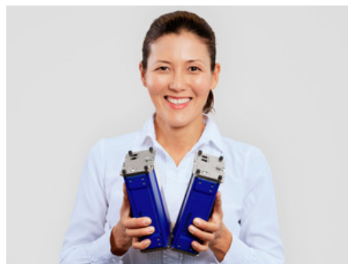
imc CRONOSflex: Click mechanism ensures flexibility