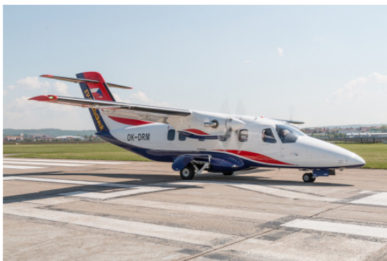
EV-55 Outback – durability testing with imc measurement systems

The test department from Evektor has chosen imc measurement systems for durability testing on this new aircraft design.