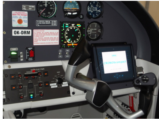
imc display mounted directly in the cockpit,

Reliable, secure testing is ensured through black-box functionality, stable power supply within the imc systems thanks to integrated UPS, as well as redundant, configurable measurement data storage (internal and external).